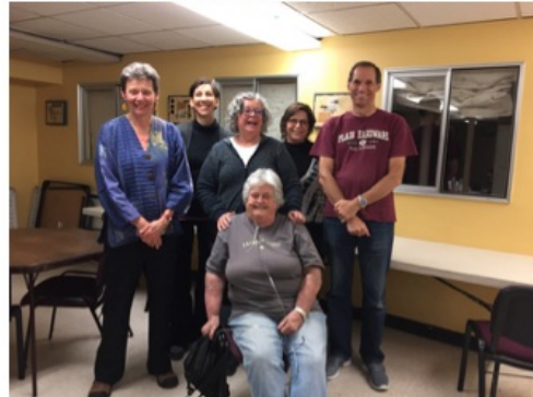
This is PNV training group