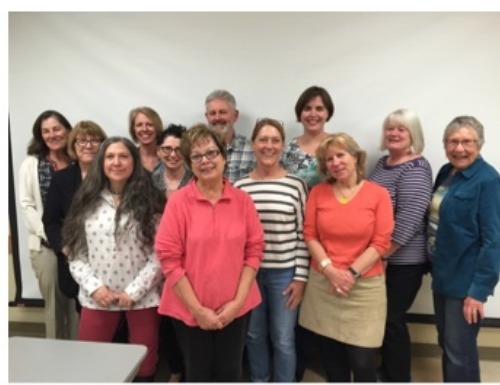
This is West Seattle group of volunteers